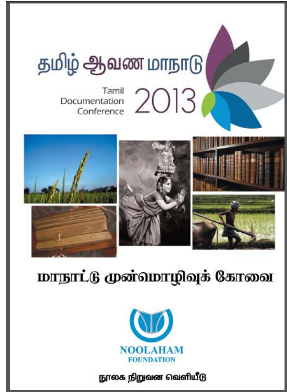
Cover page of compiled abstract book